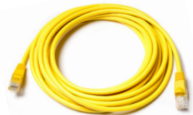
Ethernet Cable (color may vary)