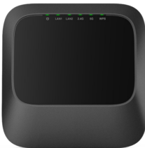
WiFi 6 Router